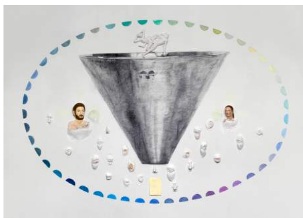
Credits: Femmy Otten, One Year in Ten #2 , 2017 - Galerie Fons Welters