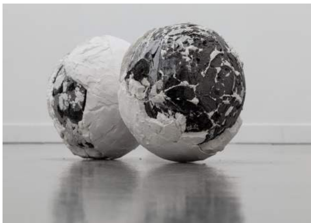
Credits: Matea Bakula, The escape of the soft sounds , 2018 - LumenTravoGalerie

Award ceremony on Wednesday, 6 February during the opening of Art Rotterdam 2019