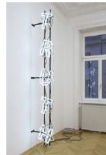
FAMED ASPN Room for an answer, 2018