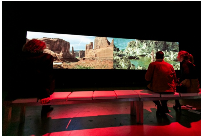
The video section Projections returns in an extra-large format

The lack of space at previous locations, which hindered the presentation of the Mondriaan Fund's Prospects exhibition, for example, prompted the move to Rotterdam Ahoy. At the new location, existing and new sections will be given free rein, such as the large-scale video section Projections, Intersections and Sculpture Park. In addition, the 2025 edition features more foreign galleries than ever. Rotterdam Ahoy also provides an attractive variety of catering facilities.