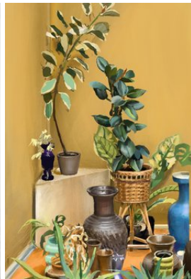
GRIMM Main Section Matthias Weischer Untitled, 2024 iPad Drawing