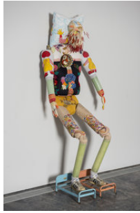
Zwart Huis Solo/Duo Christophe Coppens Self-portrait, 2019