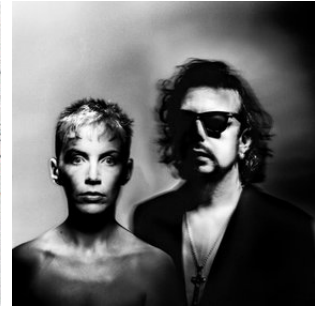
Christian Ouwens Galerie Solo/Duo Anton Corbijn Eurythmics, London, 1990