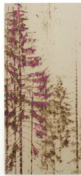
The Flat-Massimo Carasi Solo/Duo Stefano Caimi Arborescent #10, 2024