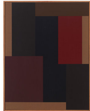
Rueb Modern and Contemporary Art Main Section Geert van Fastenhouout Painting no.18, 2005