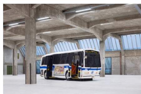
Red Grooms, 'The bus', 1995, Fenix, Rotterdam