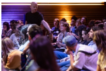
Mondriaan Fonds Power up your art practice, Photo: Maarten Nauw